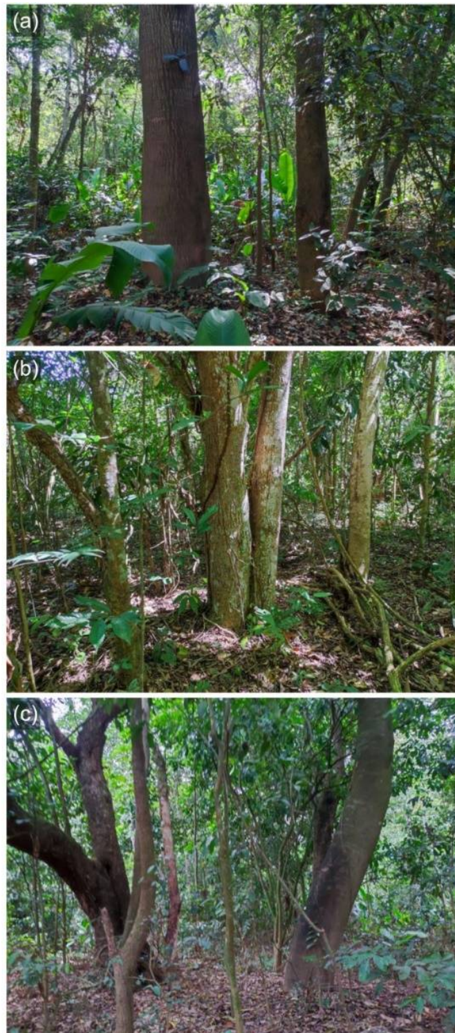
Fig. S1 - Sampling sites in riparian forests at the upper Doce River watershed, Bom Jesus do Galho-MG, southeastern Brazil. (a): Site 1; (b) Site 2; (c): Site 3.