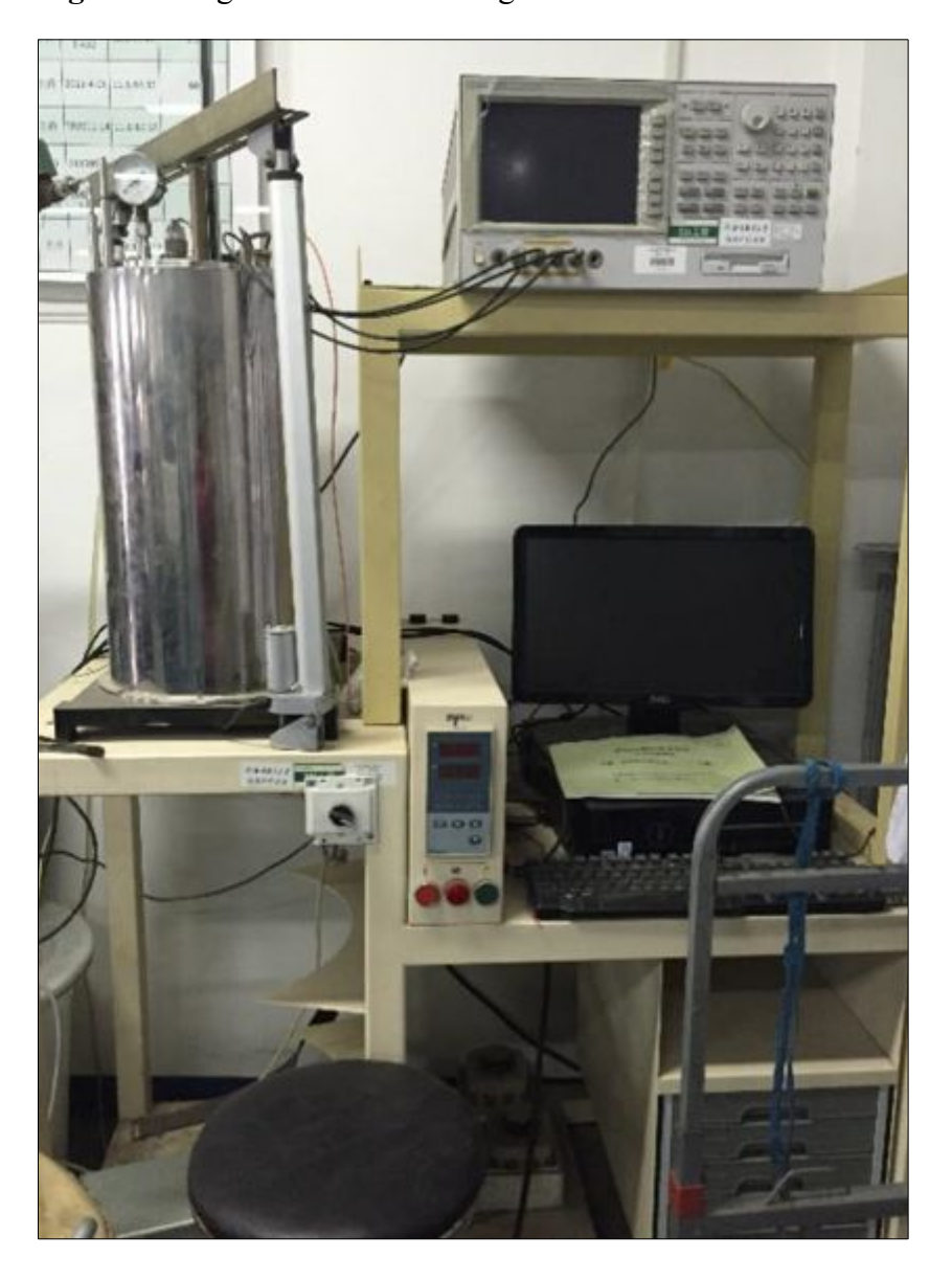
Fig. S1 - Image of dielectric testing machine.